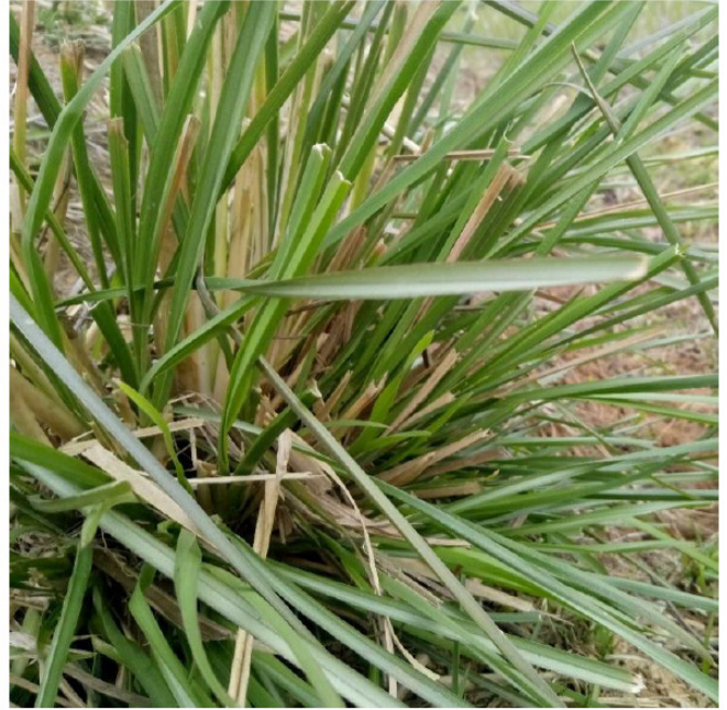
Chrysopogon zizanioides (L.) Roberty