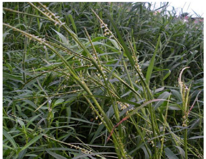
Hemarthria compressa (L.f.) R.Br.