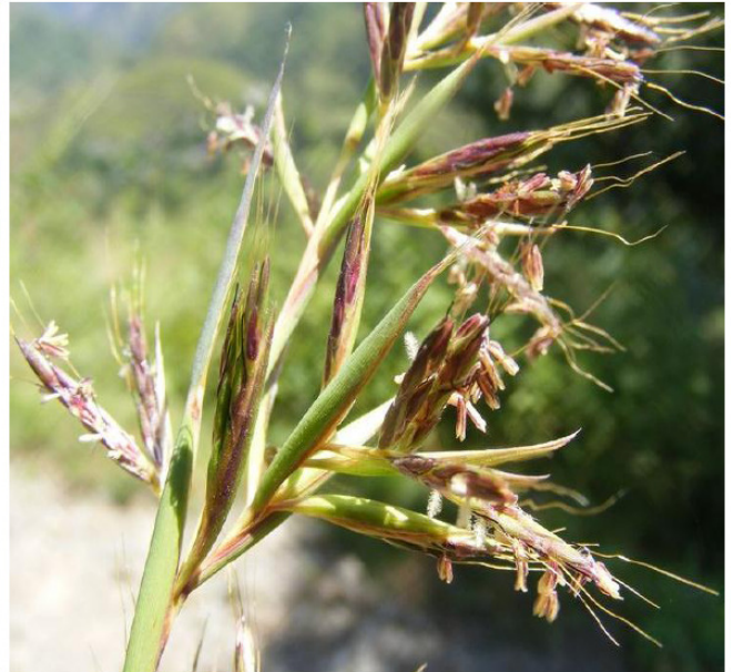
Cymbopogon martinii (Roxb.) Wats.