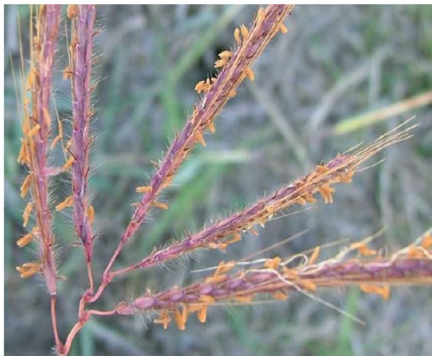
Dichanthium annulatum (Forssk.) Stapf