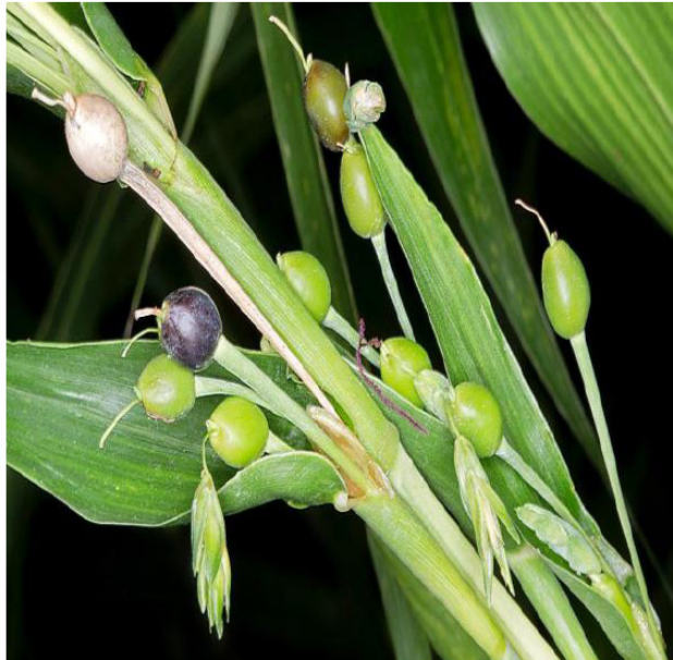
Coix lacryma-jobi L.